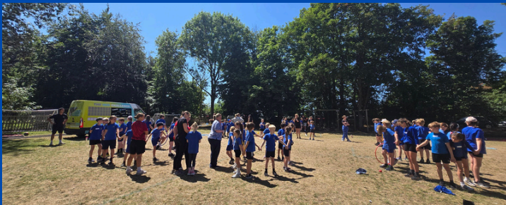
In the Woods with Year 6