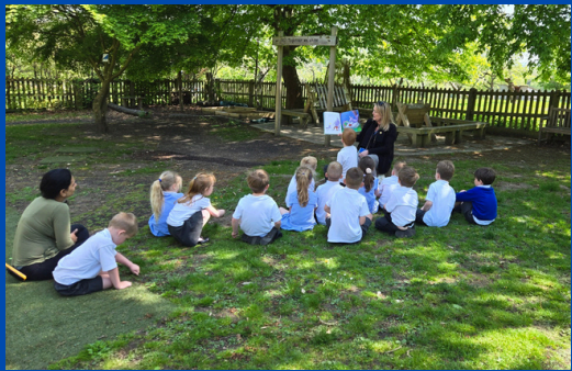
Class one - Stories in the sunshine

HERE'S TO MORE SUNNY DAYS, PEACEFUL MOMENTS, AND EXCITING LEARNING ADVENTURES THIS TERM!