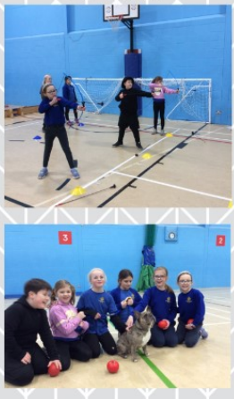
Amazing Archery and Bustin' Boccia. TG Team