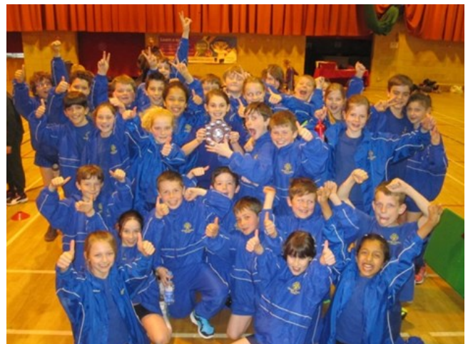
Team TG after their victory

As this event concludes the athletic season, many sporting eyes are watching this miraculous school as they take victorious steps towards unbelievable achievements. I have no doubt that they will accomplish in the hardest of competitions and will sprint, jump and hop their way to triumph.